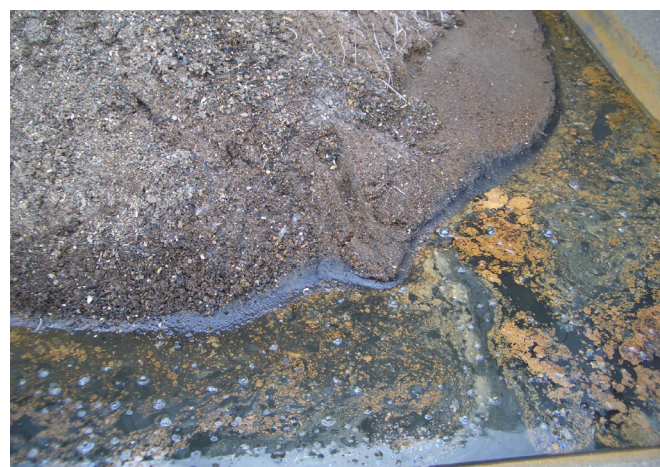
Removes odour substances up to 99%