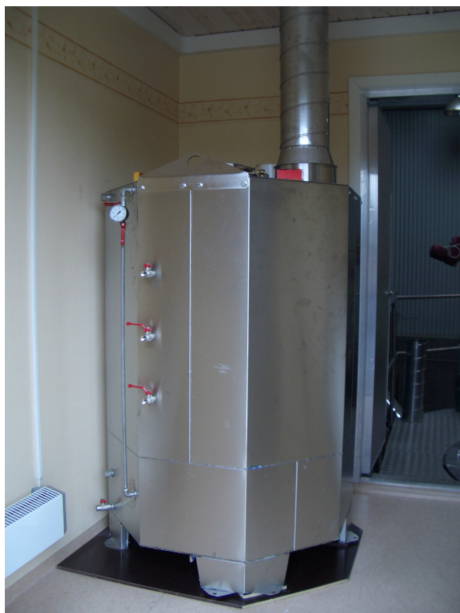
Meva Odour Control System OCS