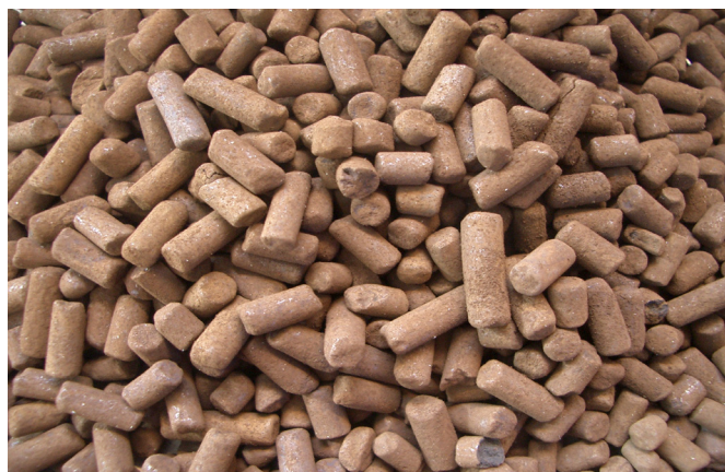
Type of carbon is chosen and combined depending on the pollution

Meva OCS can be installed in existing ventilations or in new buildings to eliminate the mentioned problems. The unit does not require any maintenance or service and reference products have been operating for more than eight years, before the carbon needed to be exchanged.