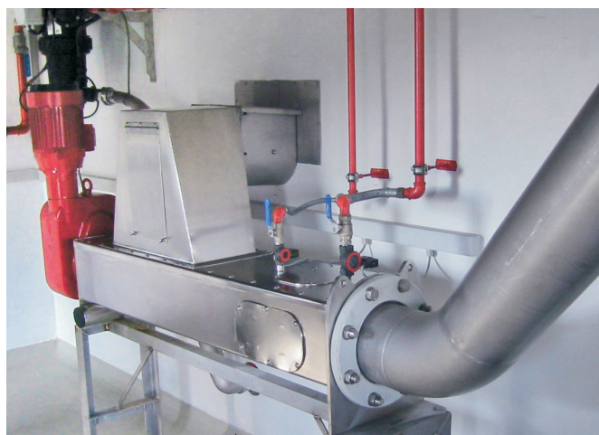
Meva Screw Wash Press - Compact and easy to operate