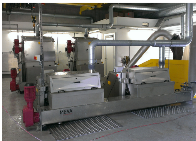
Washing and dewatering