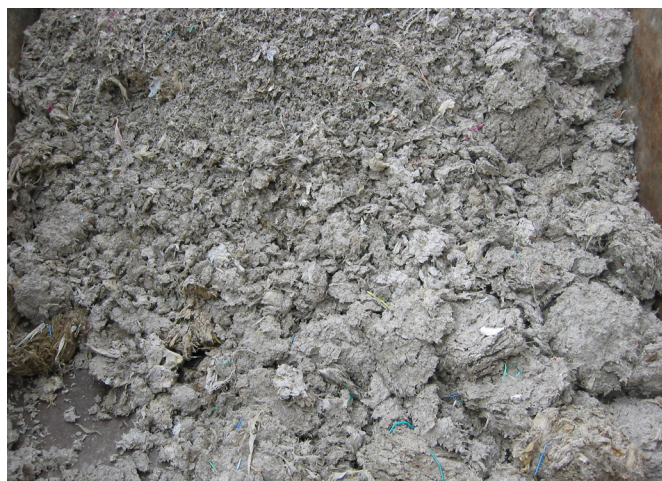
Washed and dewatered screenings