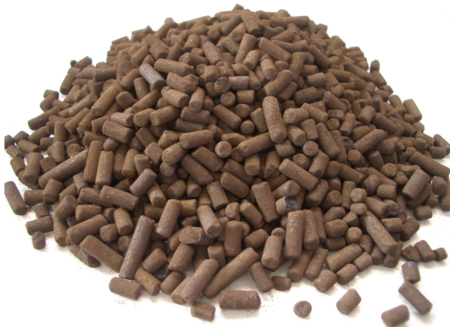
Carbon types are chosen and combined depending on the pollution.

The OCS unit can be connected both before and after the fan. The polluted air is led in at the bottom, passes through the carbon bed and is led out at the top of the OCS unit. The carbon bed is designed with regard to the substances which are to be removed from the air, and the desired flow. The OCS unit does not contain moveable parts and does not need any maintenance. The carbon should not be washed. When the carbon is used it should be sent for destruction.