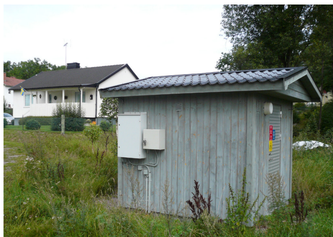
Odour removal for pump stations close to other buildings