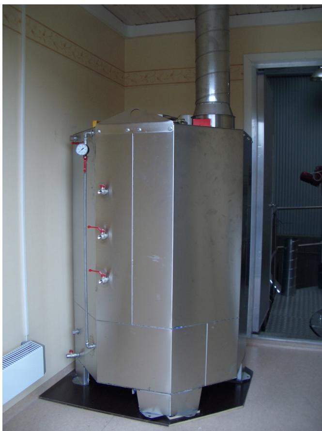
Meva Odour Control System OCS