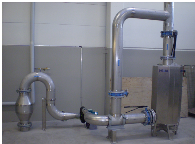
Removes odour substances up to 99%