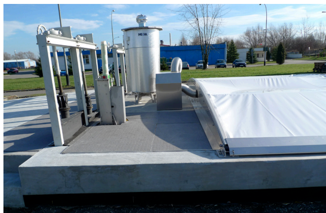
Insulated and heated, for outdoor installation. Here together with Zickert Cover - Z6000.

Meva OCS can be installed in existing ventilations or in new buildings to eliminate the mentioned problems. The unit does not require any maintenance or service and reference products have been operating for more than twelve years, before the carbon needed to be exchanged.